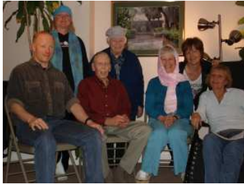
This is a picture of 7 (half) of our community. ﴿